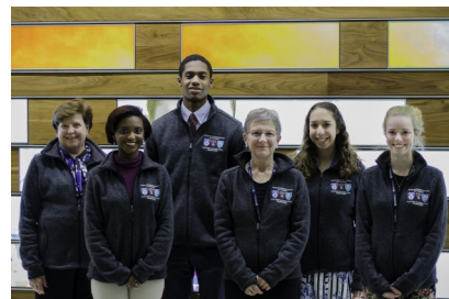
Members of the ORE Core of MADRC and CART

The MADRC Outreach, Recruitment & Engagement (ORE) Core increases public awareness about the importance of Alzheimer's disease (AD) clinical research, educates the community about current advances in early AD and other neurodegenerative diseases, research, and supports recruitment and retention for MADRC-affiliated clinical research. The MADRC ORE is based at Massachusetts General Hospital.