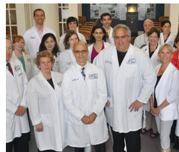
Center for Brain/Mind Medicine Staff

system. Patients receive the highest standard of neurological, psychiatric, and social work care for the treatment of their conditions.